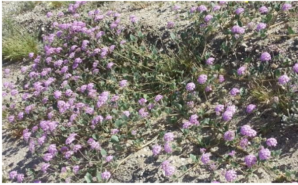
Sand Verbena adds a bit of pink or purple.