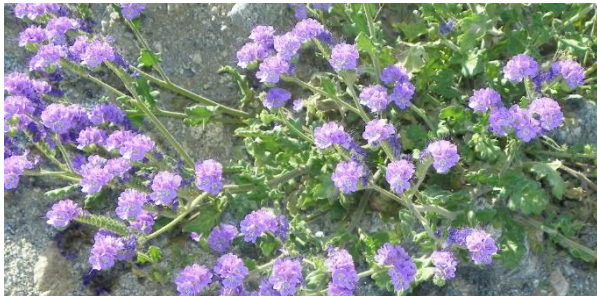
Is this Phacelia? Can you say?