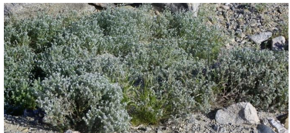
Desert Popcorn is a lovely groundcover, until its seedpods dry out and it becomes a noisome pestilence.