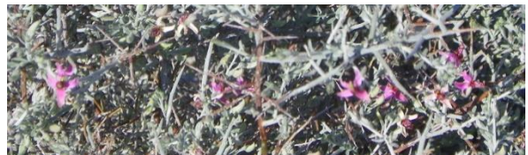
Rhatani is a minimal bloomer right now. We'll watch it.