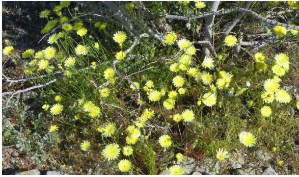
The dominant low-grower is probably Desert Dandelion.