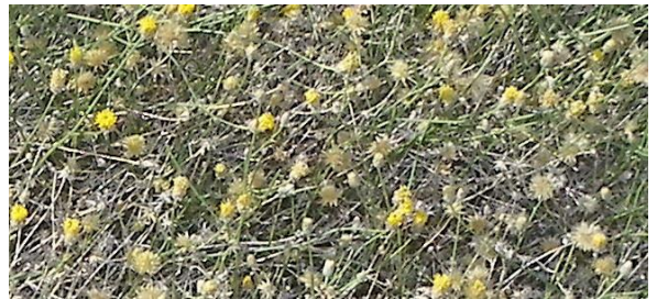
Likewise, Sweetbush is fine closeup,