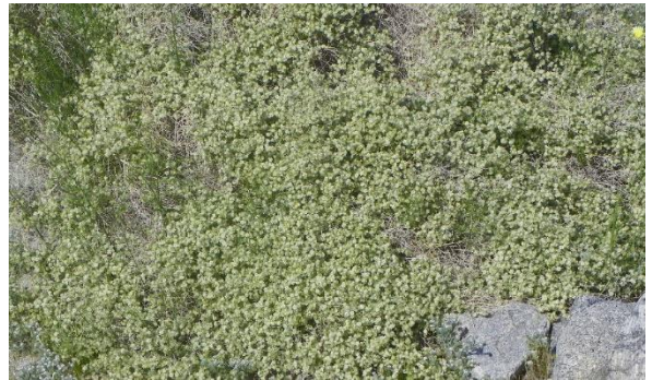
but from a distance they almost disappear.