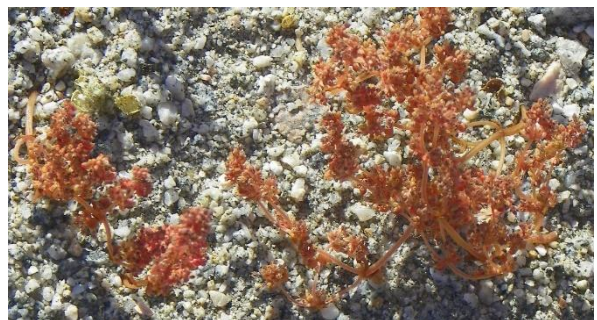
But unless we get more rain soon, Red Pygmy will not fulfill its promise. It needs to get fat and succulent, and develop into its green phase. These sprigs are about an inch and a half high.