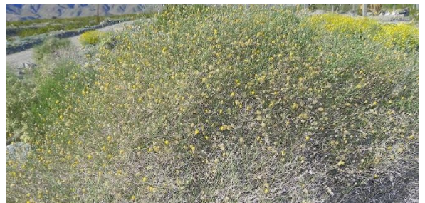
But not so special from a distance.