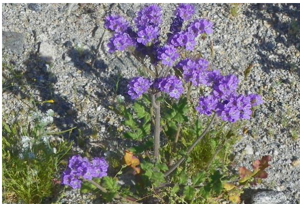
Heliotrope, I think.