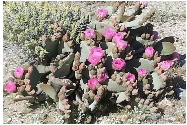
Up against the hills to our north, Beavertail Cactus is more common. This one is in Wide Canyon.