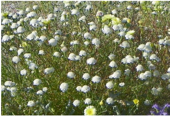
I think this is Parachute Plant. It's often found mixed in with Desert Dandelion.