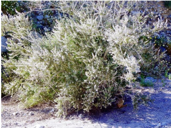
We don't have a lot of Sage in Sky Valley. From across this wash, I couldn't tell if this one is blooming, or just putting out fresh spring leaves.