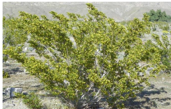
Second place goes to Creosote Bush. It's not all that showy, but it's big and obvious.