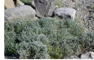
Desert Popcorn – God's Rock Garden?