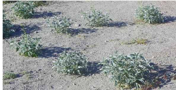
And there are thousands of baby Brittles, promising, rain permitting, a bright 2018.