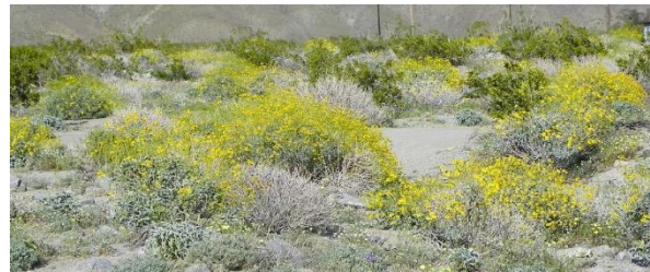
It can dominate a landscape.