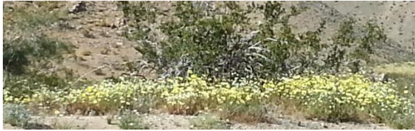
It can dominate a landscape, too.