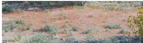
2017 started as a great year for red pygmy weed. It sprang up everywhere, more than it has for many years.