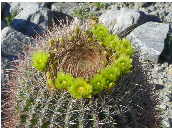
Our Red Barrell Cactus is native, unlike the Mexican Golden Barrells found in nurseries.