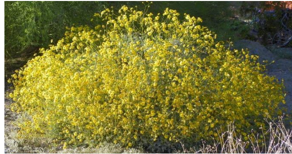
Brittlebush is probably the most conspicuous bloomer in most of Sky Valley.

If I've misidentified anything, please let me know so I can issue a correction. I want to learn, and I always welcome feedback!