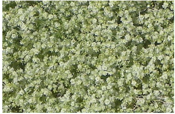
Cheesebush has pretty white flowers,